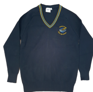
V-neck Sweater (Knit)