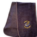
Navy Fleece Scarf